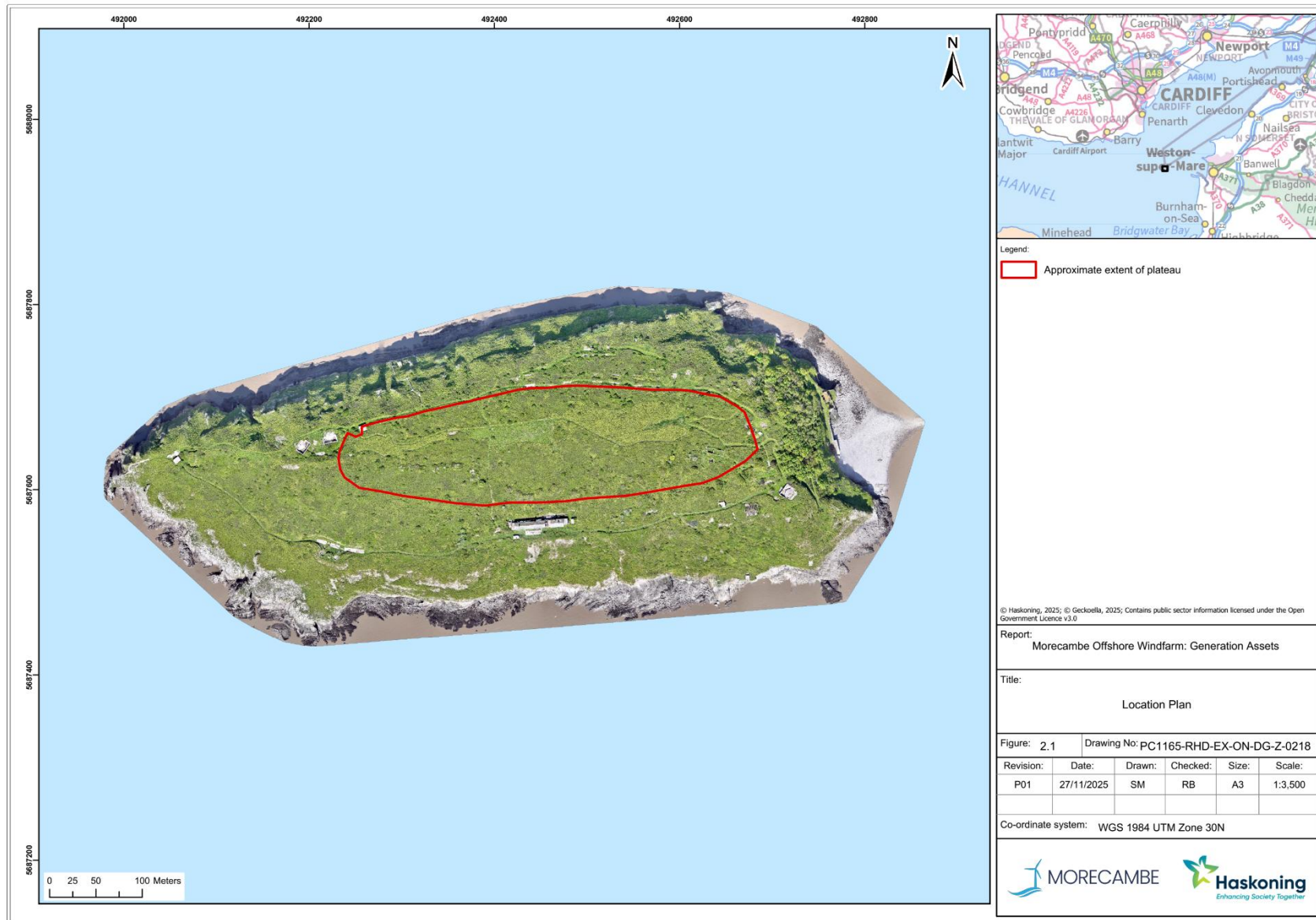
Figure 2-1: Location plan